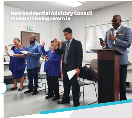
New Residential Advisory Council members being sworn in

I will participate in the coaching program and help my community by informing them about the revitalization process.